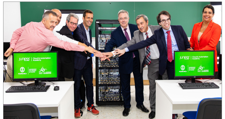
Photo: Inaugural ceremony for the Juniper Networks lab at the UPM.

Our journey began in 2020 when UPM decided to revamp its curriculum for teaching network security. The need for an immersive learning environment became evident and UPM began building a new student networking lab.